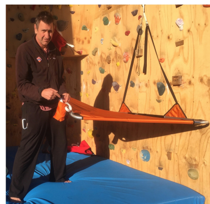
First step--unclip airside straps and stuff in bag