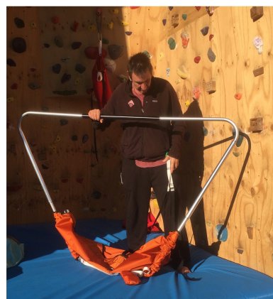
Next, Undo tensioning straps and push fabric down.